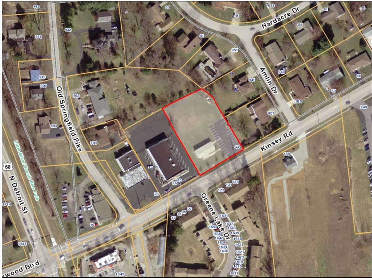
LOCATION OF THE TRACT (outlined in red)