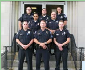
Your Police Division has 46 uniformed officers and 7 administrative employees; they respond to approx. 34,380 calls per year

Your Street Department employs 10 maintenance workers; they maintain 115 miles of streets in the City of Xenia