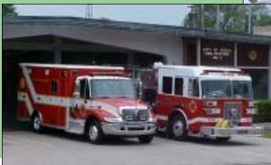
Your Fire Division has 41 uniformed firefighters and 1 administrative employee; they respond to approx. 4,200 calls per year