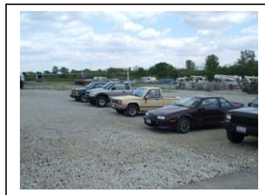
Dayton Xenia Towing