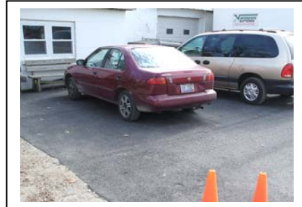
Ric's Towing Before and After